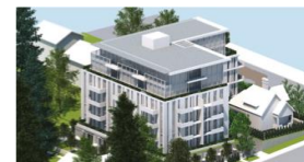
Royal Heritage Project Condo Apartments

Areva Living is a real estate and land development firm based in Vancouver. Consisting of a multidisciplinary team of dedicated individuals with extensive experience in the investment, design-build and development fields. Alongside management, Tricor is a major investor in every project