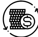
Demonstrated history of positive cash flow