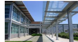
Freybe Gourmet Foods 120,000 sq ft Processing

Tricor Property Partners owns a portfolio of purpose-built, industrial, single-tenant real estate across Canada and the U.S. Tricor is actively pursuing new direct real estate investments in mature, single and multi-tenant industrial properties, including sale-leaseback transactions