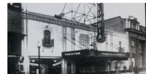
Heritage Restoration The Columbia Theatre