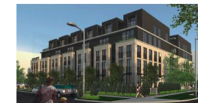
The Rupert Townhouse Project