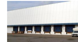
P B Distribution 58,000 sq ft Distribution