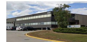
Confederation Freezers 331,645 sq ft Cold Storage