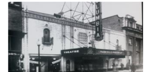
Heritage Restoration The Columbia Theatre