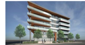
Oxford Rental Apartments