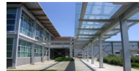
Freybe Gourmet Foods 120,000 sq ft Processing

Tricor Property Partners owns a portfolio of purpose-built, industrial, single-tenant real estate across Canada and the U.S. Tricor is actively pursuing new direct real estate investments in mature, single and multi-tenant industrial properties, including sale-leaseback transactions