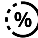
Majority or path to majority ownership, up to 100%