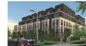
The Rupert Townhouse Project