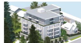
Royal Heritage Project Condo Apartments

Areva Living is a real estate and land development firm based in Vancouver. Consisting of a multidisciplinary team of dedicated individuals with extensive experience in the investment, design-build and development fields. Alongside management, Tricor is a major investor in every project