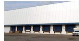
P B Distribution 58,000 sq ft Distribution